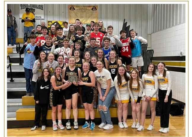
23-24 Ladies Basketball District Champs