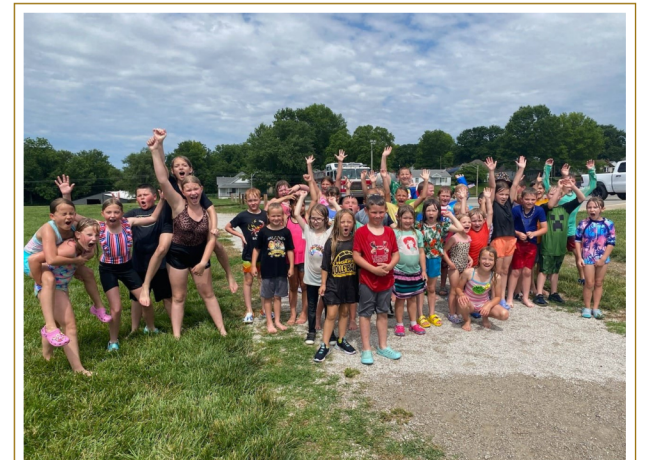
Summer School Fun

Address: 800 Hwy 131, Wellington, MO 64097