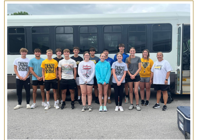
23-24 State Track